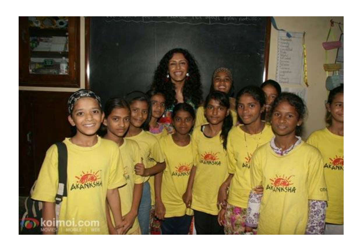
The kids of NGO Akanksha visited on the sets of The Buddy Project – Wallpaper