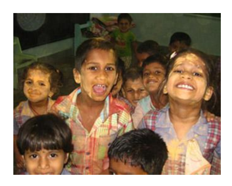
Mahalaxmi Mumbai Public School